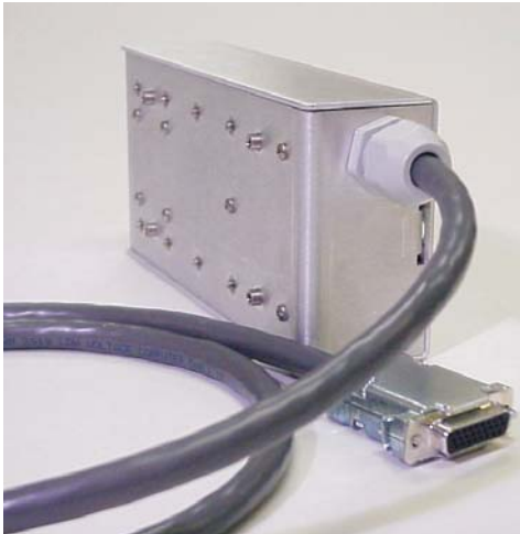
28208-1-ITB Isothermal Block

The 28208-1-ITB Isothermal Block provides a digital reference junction sensor and screw terminal connections for eight thermocouples (2 wires plus shield). Power to the temperature sensor is provided by the 28208 card. The standard 28208-1-ITB has a 4-foot long cable that interfaces directly to the input connector of the 28208 card. The Isothermal Block may be located remotely using a block (CB-HD26S/HD26P-L) extension cable so as to avoid long thermocouple extension leads. Maximum extension cable length is 150 feet.