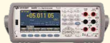
Keysight 34465A High-Performance Multimeter