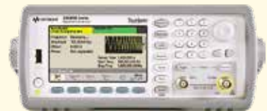
Keysight 33509B Function/Waveform Generator

The 28000-?-TEST test subsystem consists of third-party test instruments to provide signal sources and precise measurement capability. A Keysight 33509B function generator is used as the source of the test signals. The 28000-5-TEST provides a Keysight 34465A 6.5 digit multimeter (DMM) for measurement capability. The 28000-7-TEST supplies a precision 8.5 digit 3458A DMM, required to test 28000 cards with high DC precision. In addition, the 28000-?-TEST includes a kit for rack mounting and cables necessary to connect the instruments to the 28000 test and monitor busses.