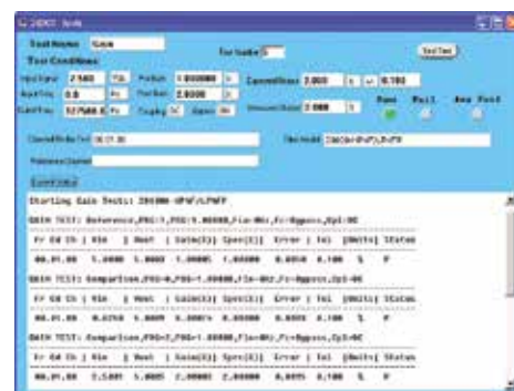
The FAT test screen reports the test conditions and provides a tabular listing of the test results during the execution of the test sequence.