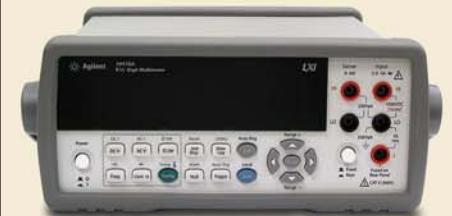
Agilent 34410A High Performance Multimeter

An Agilent 34410A High Performance Multimeter provides the measuring device in the 28000 Test System.