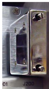
TEDS TEST Adapter installed on a 28314 Card