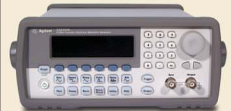
Agilent 33220A Function Generator

An Agilent 33220A function/arbitrary waveform generator is used as the source of test signals in the 28000-4A-TEST Test System.