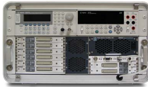
Test System Installed with a 28008-M3 Frame

The 28000-4A-TEST Test System, the 28000-BIF1-FT interface card and the 28000 GUI support a complete suite of tests that run on the instrument "in-place" without removing the system from the equipment rack. The tests check out all critical system specifications, are NIST traceable and are the same manufacturing tests that are run at the factory.