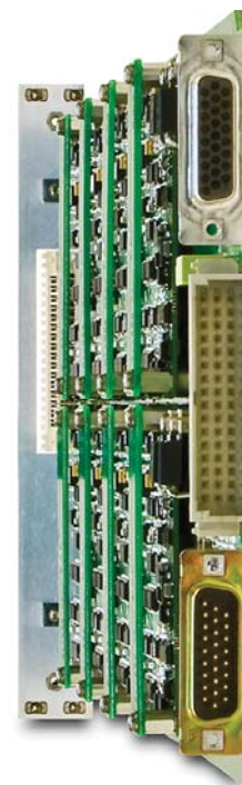
Rear Panel Input and Output Connectors

A switch at the output of each channel allows for multiplexed connection to the 28000 chassis output monitor bus BNC connector for viewing the channel output with an external device.