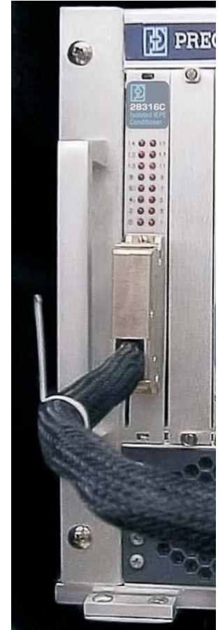
28316C Card Installed in 28016-M3 Frame

The 28316C test software selects the test source amplitude and test source frequency appropriate to the filter type and settings and it uses the current settings of channel gain.